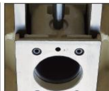
Precision hand scraped wheel head unit and its ways with continuous lubrication.