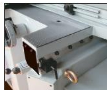
Delicate saddle clamping device is provided for shoulder and slot grinding.