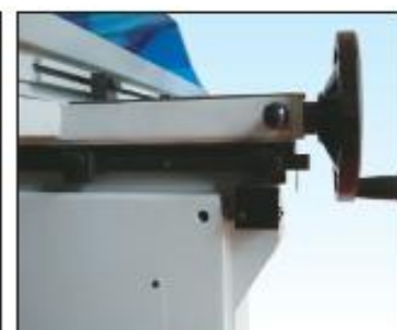
Non-contact proximity switches and dogs for cross feed stroke adjustment.