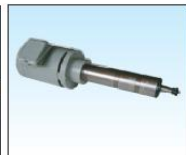
Cartridge type spindle unit with precision bearings class ABEC7(P4) and direct drive motor (V3 vibration class)