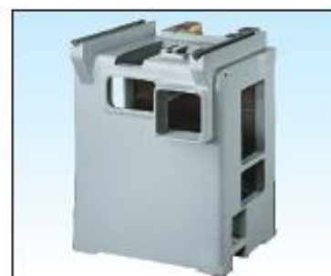
Rib reinforced box type base, with enlarged double Vee ways to ensure the best foundation of accuracy.