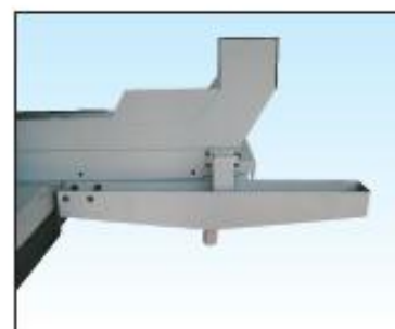
Big volumn drain device installed externally for easy accessing and cleaning.

(Note: The marks "*" to be installed at factory)